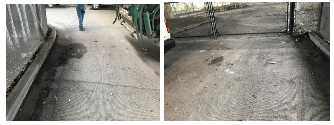
1<sup>st</sup> and Mead St: 5-Tents, 800 lbs of debris-4/6 • Before